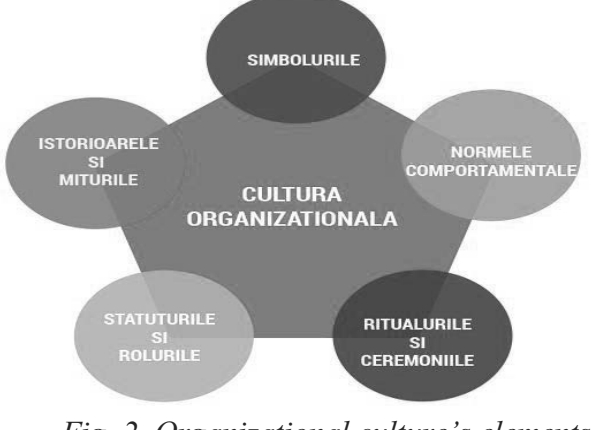
Fig. 2. Organizational culture's elements

The organization culture is represented by the organization's struggle to adapt through diversification, by developing some specific cultural characteristics not only for emphasizing its specificity and to compete against other organization but to stay on the market and to record a positive evolution. Therefore, organizational culture comprises the following elements: